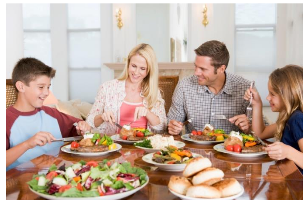
Family time at the dinner table

Some host families may allow you to cook in their kitchen, others would prefer you did not. You will need to respect this rule.