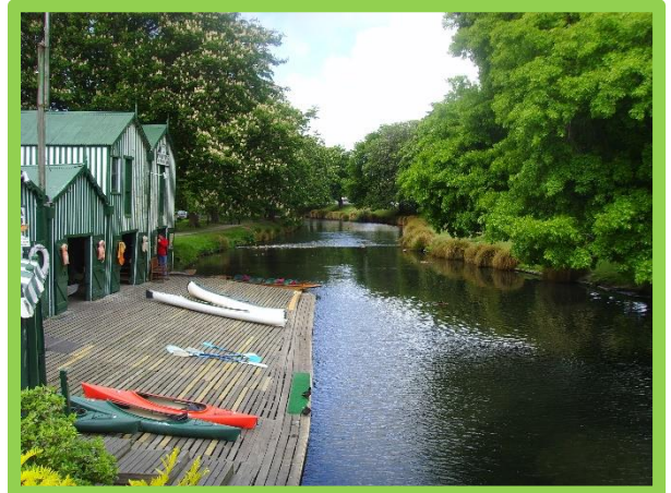
Kayaking on the Avon River

The legal age for drinking alcohol in New Zealand is 18. International Students are not allowed to drink alcohol or take drugs whilst they are in New Zealand studying at Burnside High School. In some countries teenagers are allowed to drink beer or wine at home with their families when they are over the age of 16, but in New Zealand this is not allowed. It is against the law for adults to give alcohol to under 18 year old International students. Regardless of your age, do not consume alcohol in your homestay.