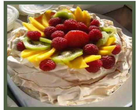
Pavlova – a famous NZ dessert.