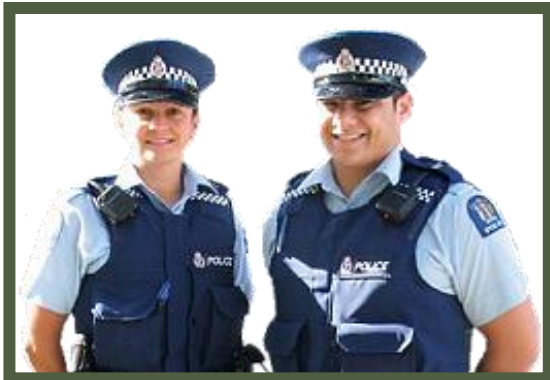
New Zealand Police

The cost of homestay accommodation is NZ$294.00 per week in 2020. The homestay fees are included in your invoice. Burnside High School will pay your host weekly.