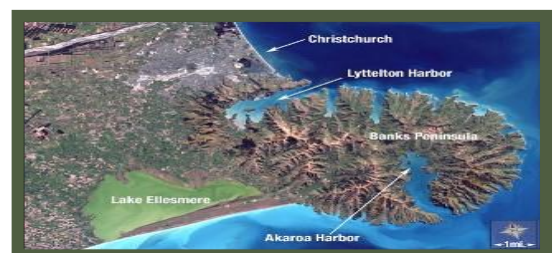
Canterbury Area Map