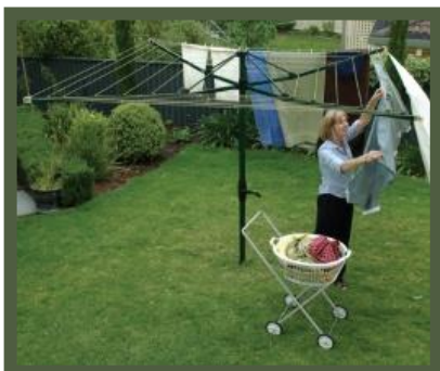
Most NZ families hang the washing outside

In most homes you will find the host parent is more than happy to do your laundry and in other homes you may be expected to do your own. Your host parent will discuss the arrangements with you. Please do not hang wet laundry/washing in your bedroom or in the closet/wardrobe. Your host will probably provide you with a bag or basket for your laundry. Your host will provide you with towels and bedding requirements.