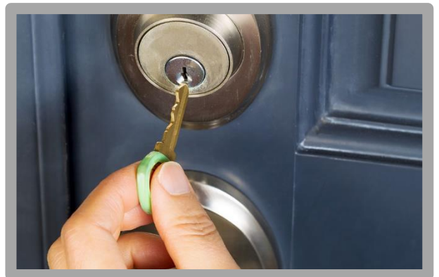
Locking the front door when you go out