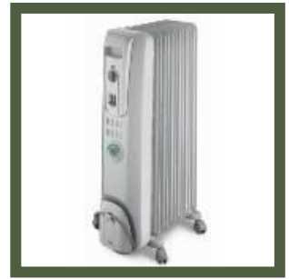
One type of heater you may have in your bedroom